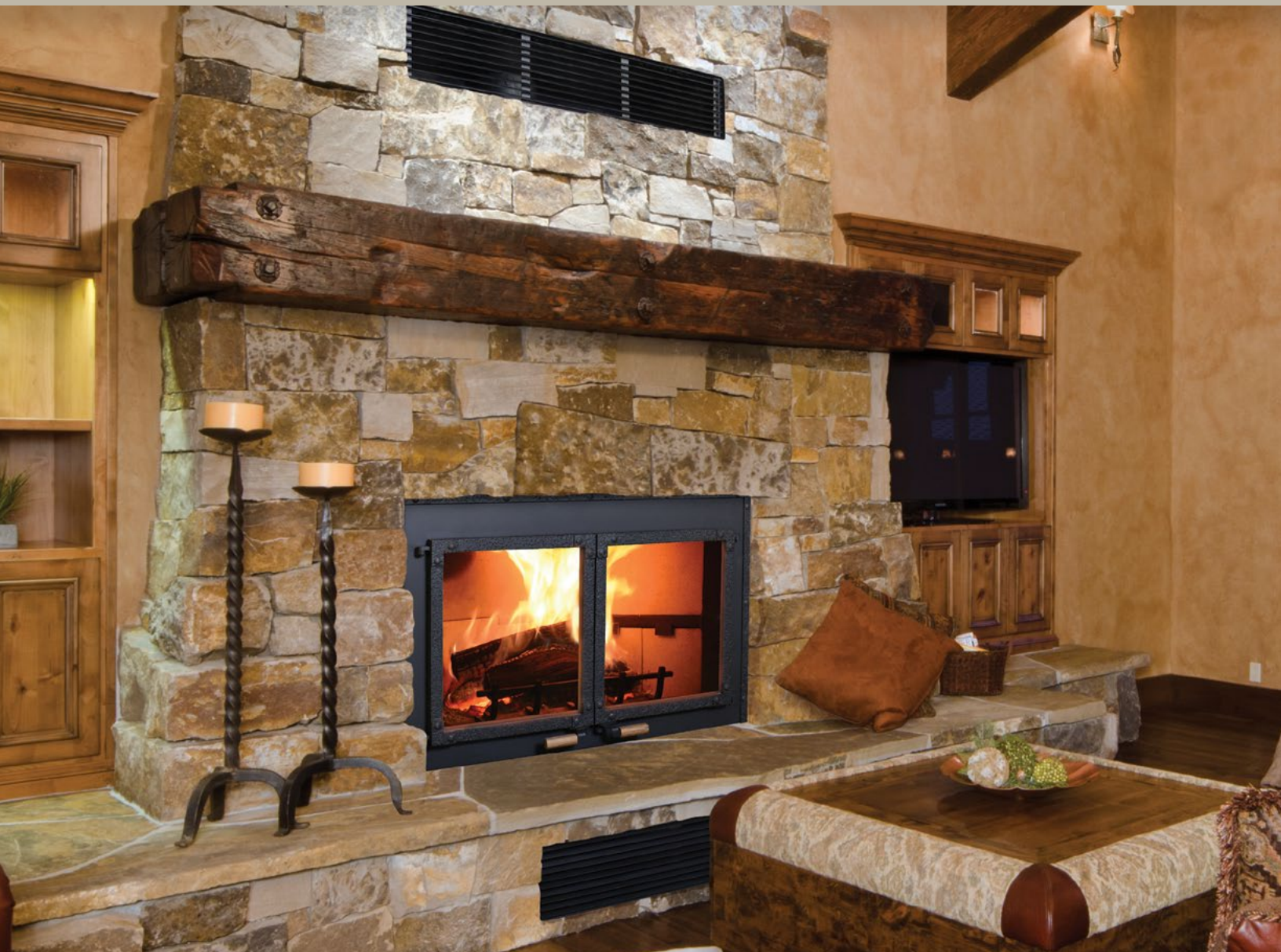
Ancient Iron Door

High Efficiency, Heat Circulating Fireplace