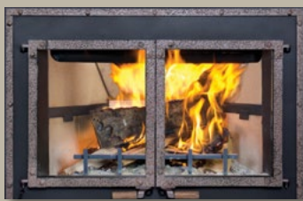
Taconite Trim Ancient Iron Door

While you’re relaxing in the warmth of the fire, the GranView is hard at work burning the smoke that is wasted by normal fireplace designs. This clean-burning fireplace limits hydrocarbon emissions, reducing creosote accumulation in the chimney.