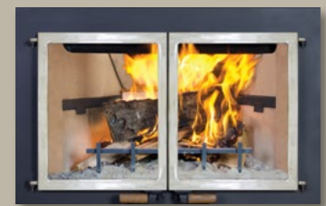
Rectangular Nickel Door