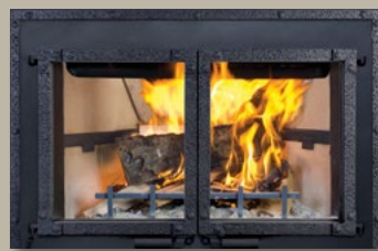
Ancient Iron Door