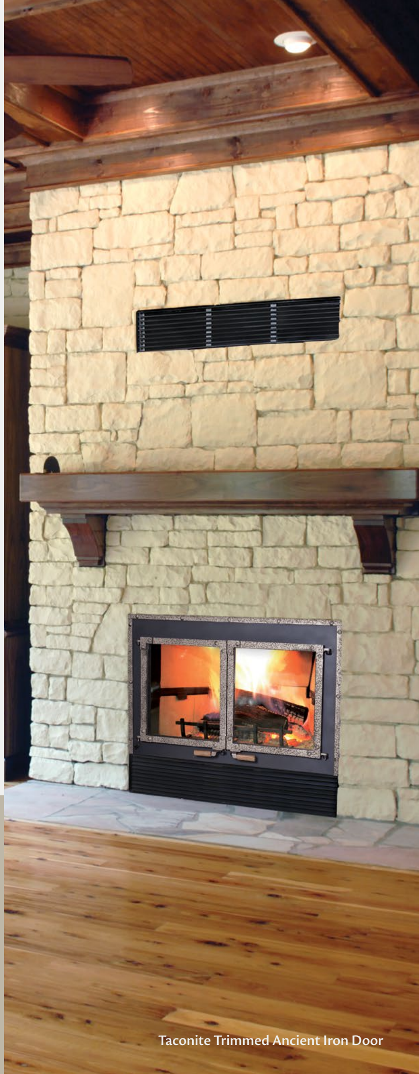
Taconite Trimmed Ancient Iron Door