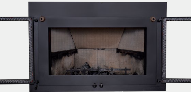
Screen for Open Burning