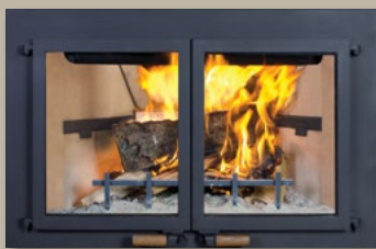
Rectangular Black Door

The GranView is in a class by itself, being the only UL listed, masonry installed, high efficiency, heat circulating fireplace. The window of flame provides a beautiful focal point for any room, without any unsightly internal obstructions. The masonry design stores heat from the fire, warming your home long after the fire has burnt out.