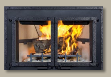
Ancient Iron Door