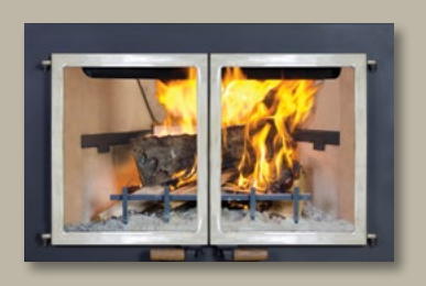
Rectangular Nickel Door